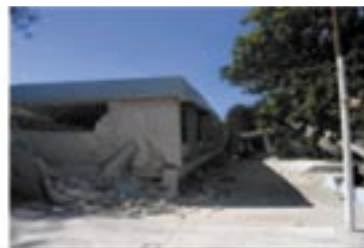
College St. Pierre