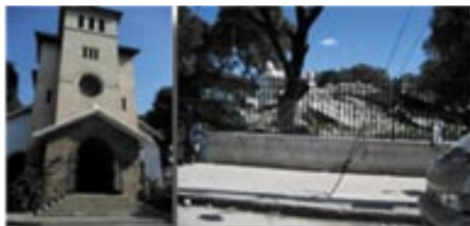
Holy Trinity Cathedral Before and After